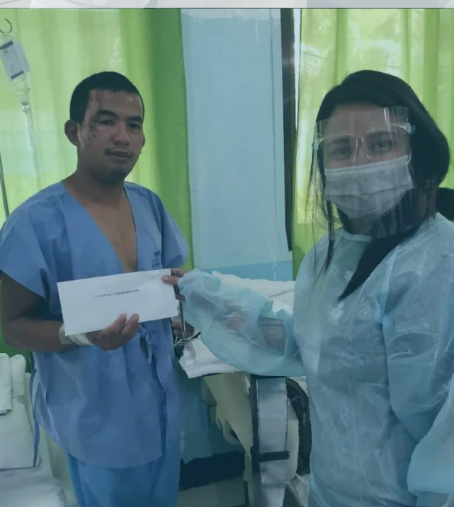
Another injured member recipient of AFPMBAI's financial aid for the crash survivors