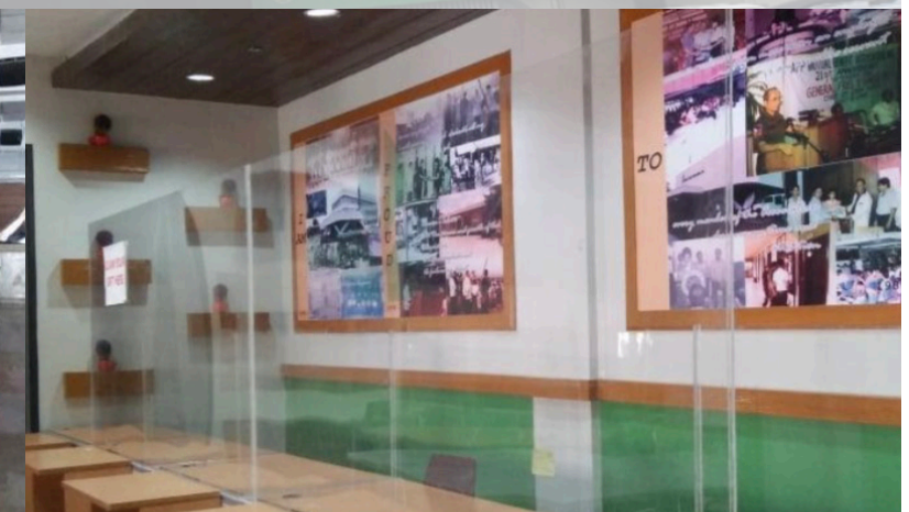
PVC cover protection for the frontliners