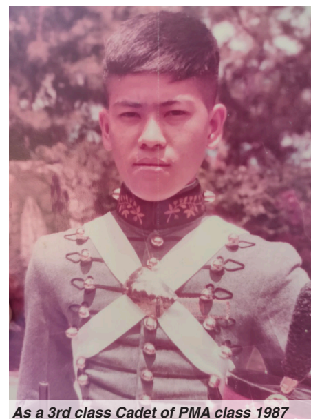
As a 3rd class Cadet of PMA class 1987

“Normally binibigay yan sa mga Navy, mga white caps officer. Di ko rin ine-expect yun, na a Marine officer like me to be the Chief Intelligence ng buong Navy, especially during the height of issues in Scarborough Shoal and in the West Philippine Sea. Those were sleepless nights kase kailangan mong mag-update everyday up to the President of the Philippines. Kailangan timely ang pag-relay ng information, not more than 24 hours, with complete reports and