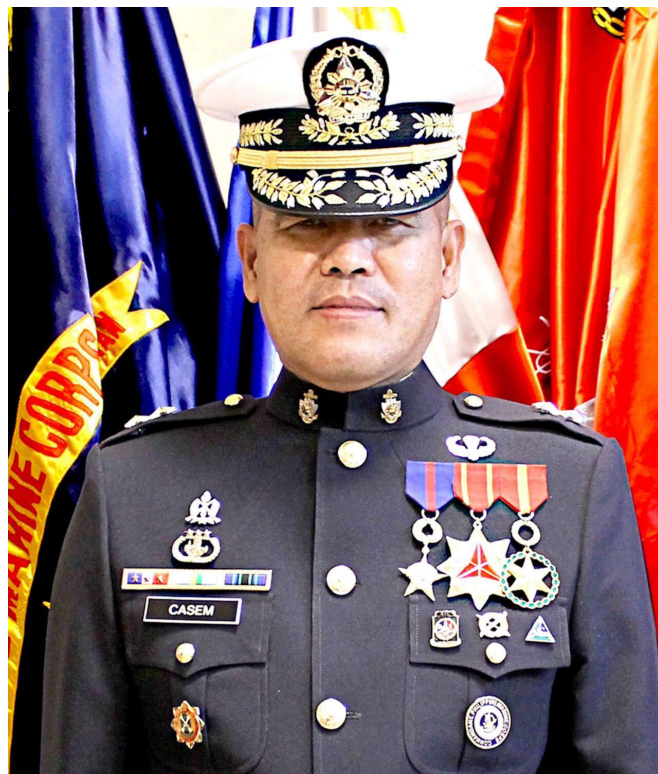
As the 32nd Commandant, Philippine Marine Corps