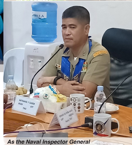
As the Naval Inspector General