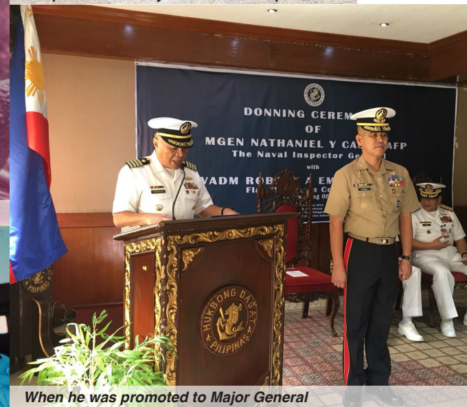
When he was promoted to Major General