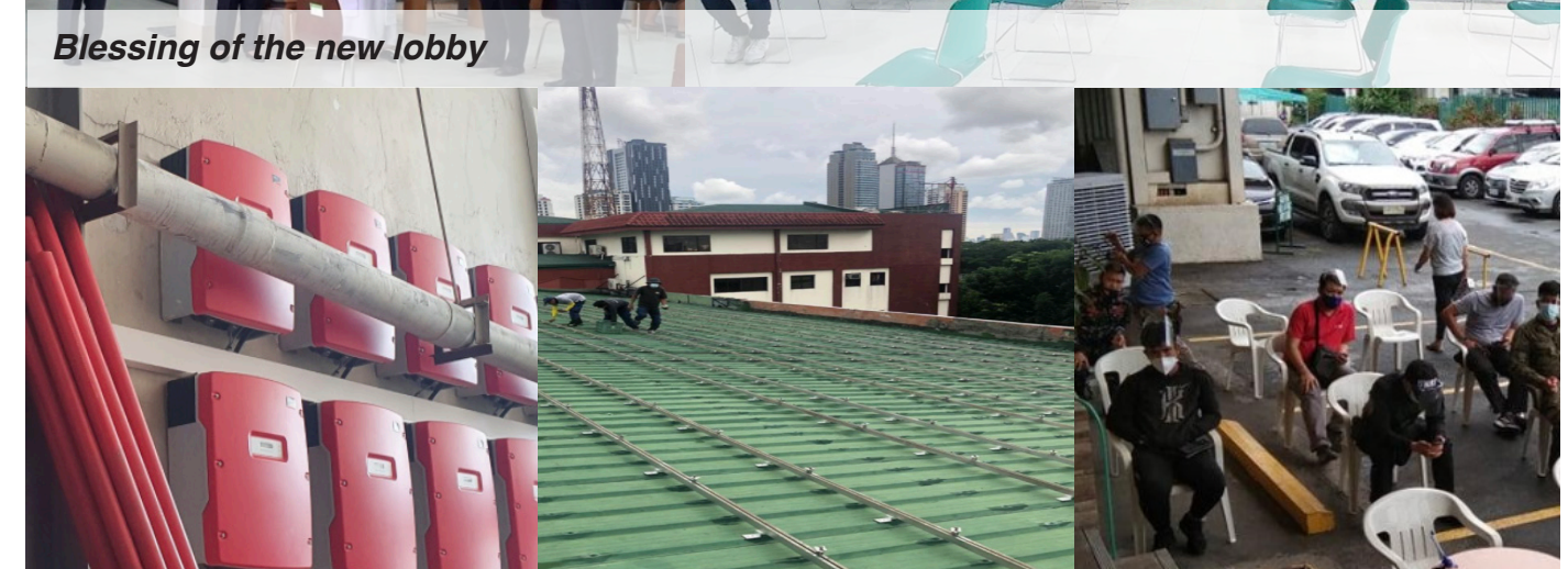
Transfer of solar panels