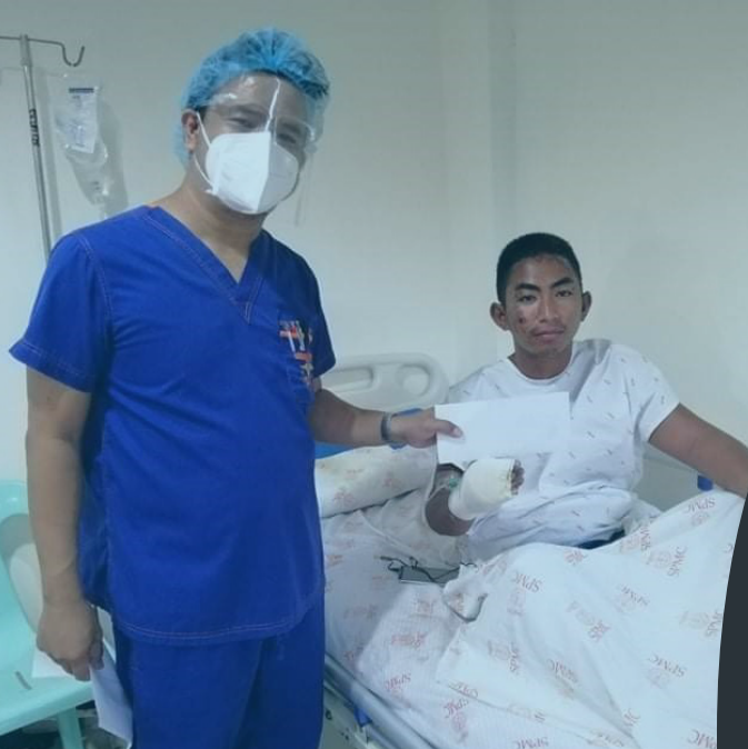
One of the wounded members receiving his financial assistance from AFPMBAI