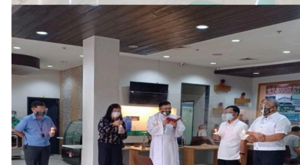
Blessing of the new lobby