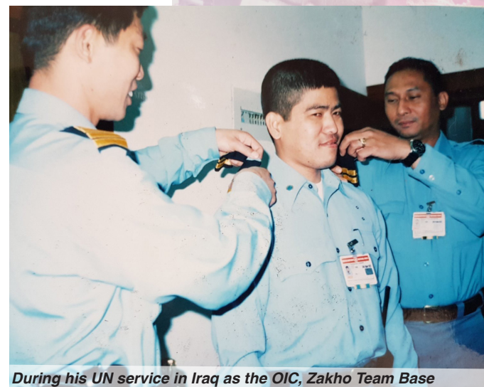
During his UN service in Iraq as the OIC, Zakho Team Base