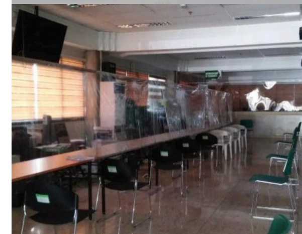
Old lobby frontliner set-up