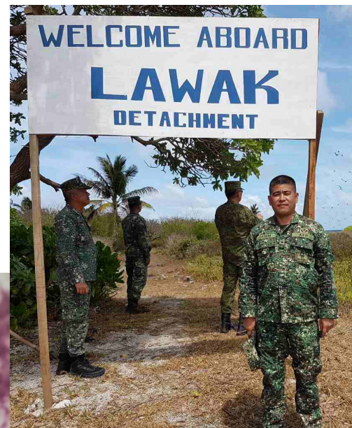
As Commander, 3rd Marine Brigade during his Troops Visit in Kalayaan Island Group