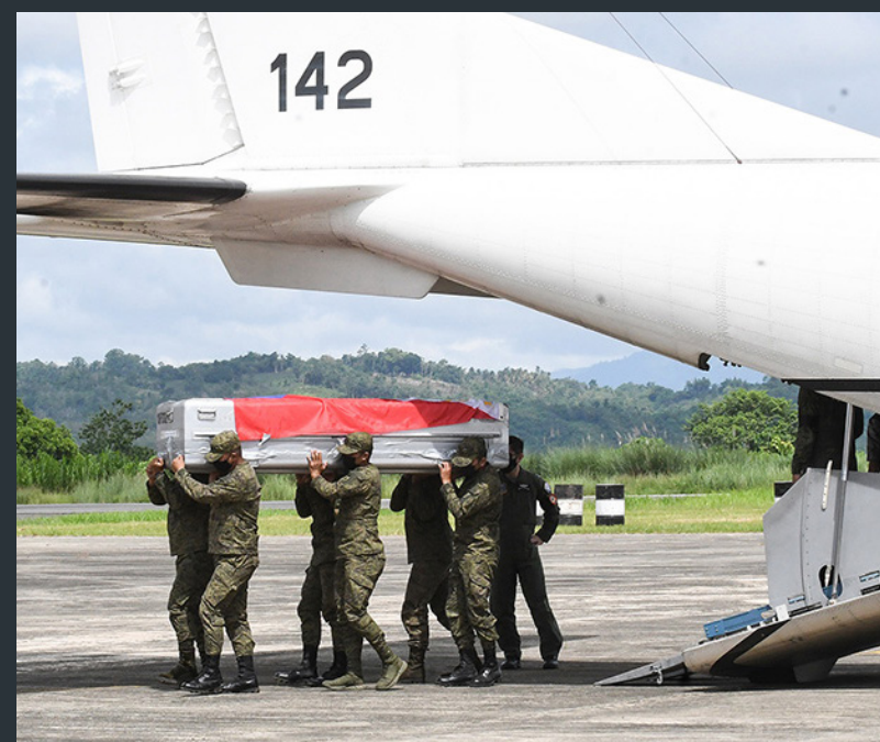
The remains of a soldier in a flag-draped metal casket is being carried by his Philippine Army brothers. The fallen member is among the casualties of the C-130 plane crash last 04 July 2020, in Sulu.

The C-130 plane crash in Patikul, Sulu last 04 July 2021 was very unfortunate, with 49 deaths and 47 injured from the military out of the 96 passengers of the aircraft. The plane left the Laguindingan Airport in Misamis Oriental without any concerns, until it was about to land and overshot the runway at the Jolo Airport. It was recently reported that several factors compounded, and led to the crash. It is by far the Philippines' worst air disaster since the 1980s.