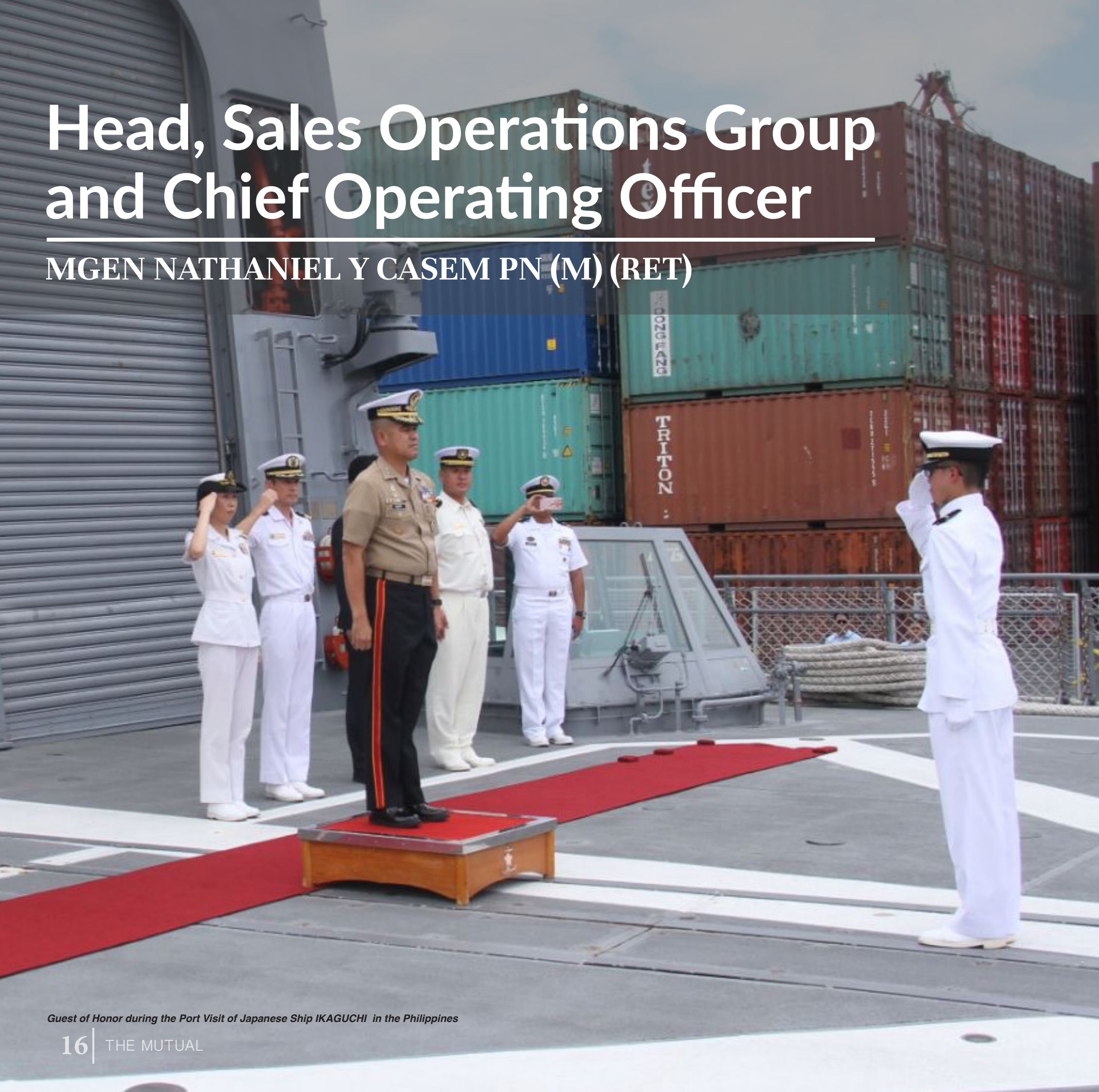
Guest of Honor during the Port Visit of Japanese Ship IKAGUCHI in the Philippines