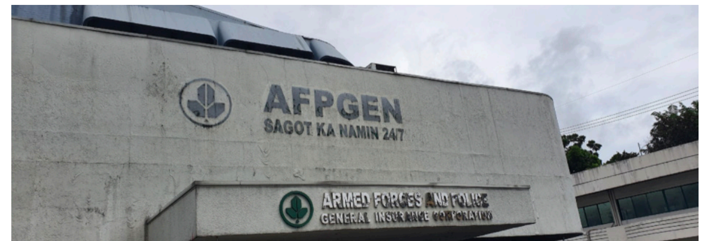
Transfer of AFPMBAI Signage

The current office setup is working well for the Association, especially in terms of serving the members. The admin team is closely monitoring this setup to ensure that the Association's operations are running smoothly.